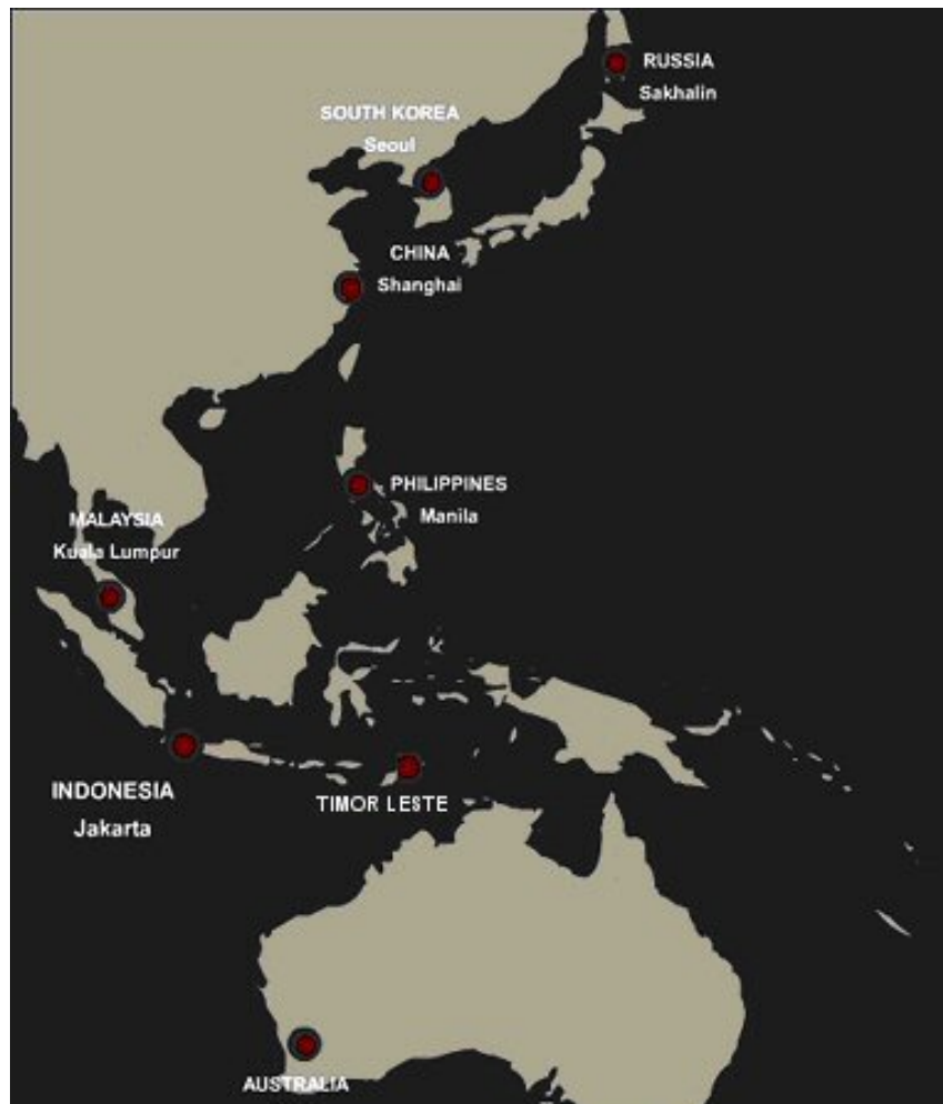
Figure 1. Map showing geographical locations of AMEC's operations in the South East Asia Region

act as centres of excellence in engineering design and asset management support services and draw on AMEC's experience of providing facility management, technical integrity maintenance, operations services, and sub-contract management to an offshore gas extraction project in the Philippines (discussed further in Section 5 ).